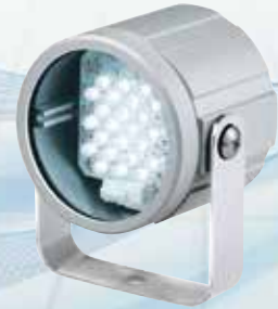
CLE-24N (Narrow Angle Type)