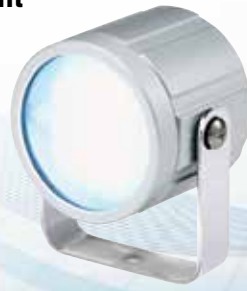
CLE-24 (Wide Angle Type)